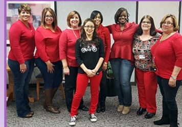
The Human Resources division wears red to encourage healthy heart awareness

The Human Resources division sponsored National Wear Red Day last Friday to promote healthy heart awareness. HCDE employees wore shades of red to support the Go Red for Women cause because 80 percent of cardiac and stroke events may be prevented with education and action.