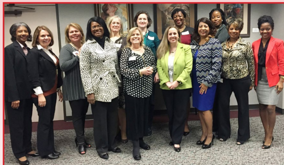
Scenes from recent District Grants Networking Meeting