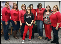
HCDE Wears Red to Support Healthy Hearts pg. 6