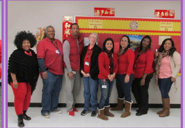
AB School staff wears red to support Go Red for Women