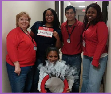
CASE for Kids supports healthy hearts on National Wear Red Day

The Human Resources division sponsored National Wear Red Day last Friday to promote healthy heart awareness. HCDE employees wore shades of red to support the Go Red for Women cause because 80 percent of cardiac and stroke events may be prevented with education and action.