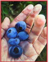
Scholastic Art & Writing Awards Students Make Headlines throughout Harris County pg. 4