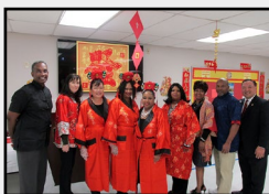
AB West Celebrates Chinese New Year pg. 6